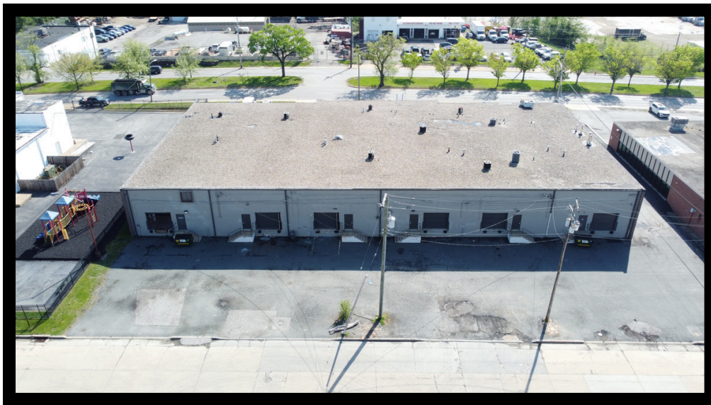
Rear Loading Area

1722-1726 EDISON HWY, BALTIMORE, MD 21213