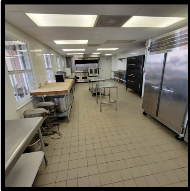
Main building Ground floor

2220 North Charles Street, Baltimore, MD 21218