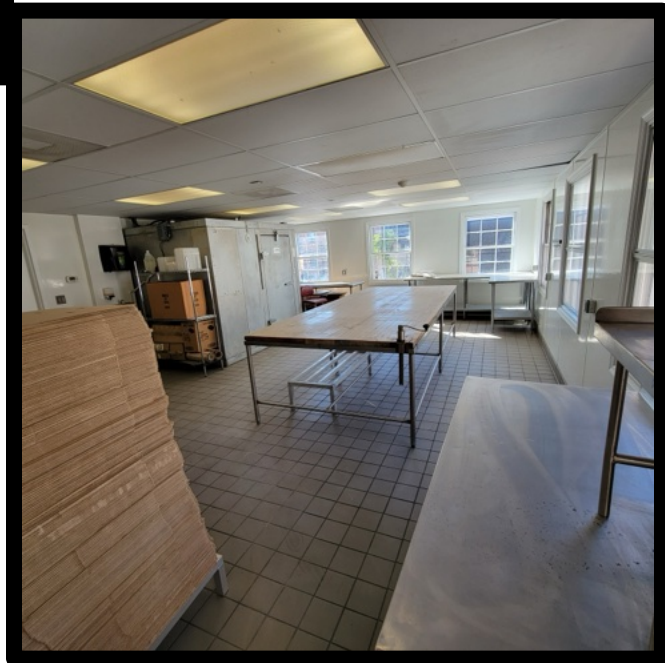
Main building 2 nd floor

Alex Simone Gold and Company, LLC 5601 Newbury St. Baltimore, MD 21209