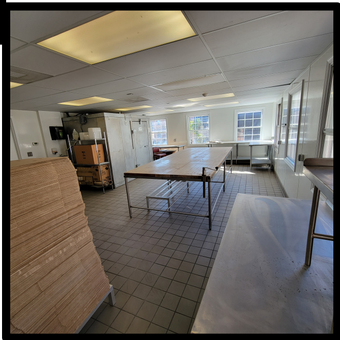
Main building 2 nd floor