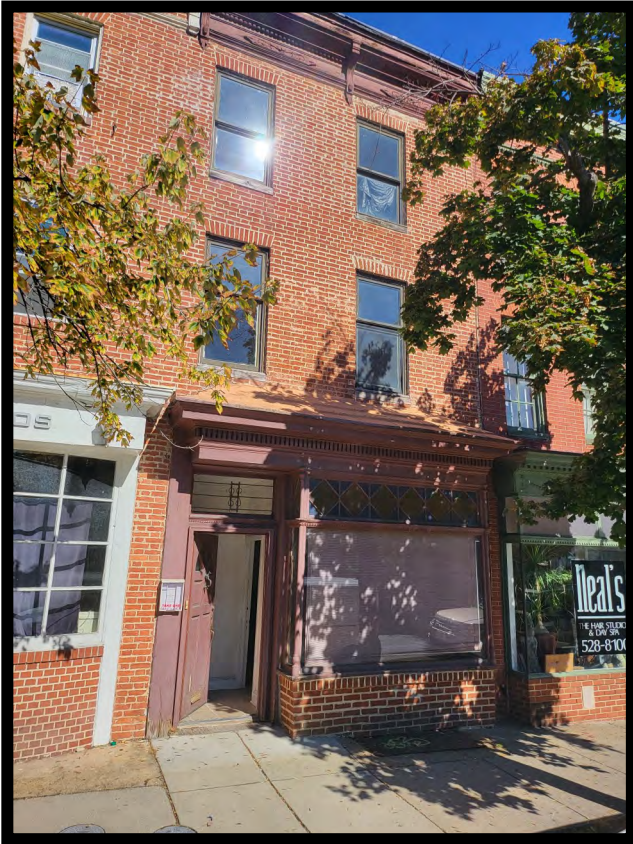
Read St. Frontage

Commercial Real Estate in the Baltimore Metropolitan Area