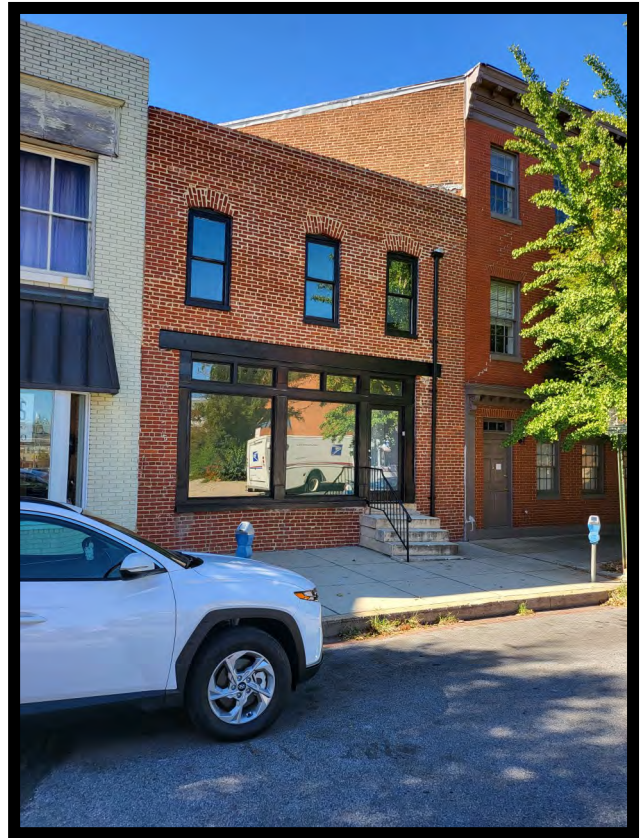
Park Ave. Frontage