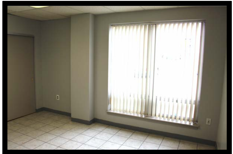
3 Private Offices

Alex Simone Gold and Company, LLC 5601 Newbury St. Baltimore, MD 21209