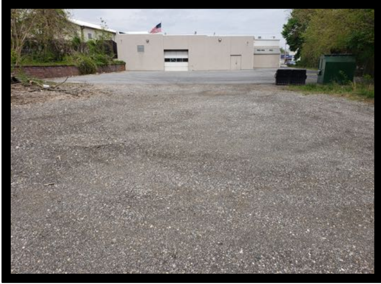
About 1 acre of parking, mostly paved, some gravel

9339 Liberty Road, Randallstown, MD 21133